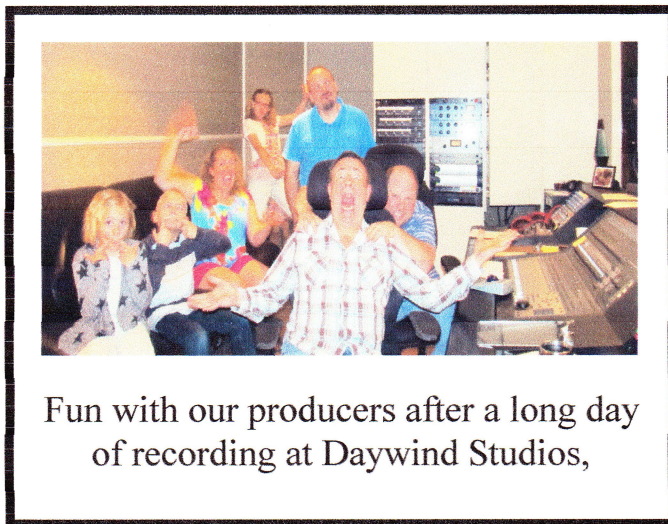
Fun with our producers after a long day of recording at Daywind Studios,