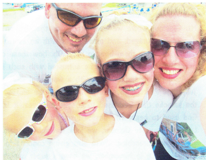
The Devine Inspirations at Conneaut Lake Park Rock the Wave Concert July 2015